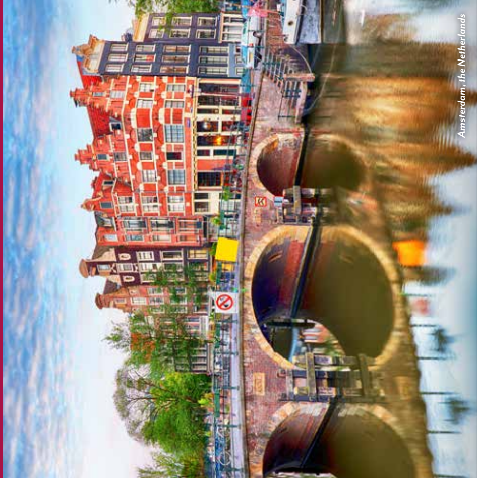
Amsterdam, the Netherlands

PRSR1 STD U.S. Postage PAID Gohagan & Company